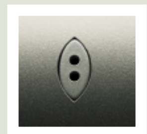
Smart ultrasound sensor

Key details: Model No. ZA2; Colour: Eden; No. of cleaning programmes: 3 (normal, quick, spot); Programmable timer: 24/7 function; Height: 13 cm; Diameter: 35cm; Navigation: ultrasound sensor system; Cleaning time: automatically calculated up to 60 min; Automatic recharging; Exhaust filter: high-grade micro filter; Batteries: 2 cadmium free (Nickel-Metal hydride); Wheels: individually sprung; Bumper: spring cushion for precision stopping; Handle: integrated into bumper; Charging terminal: for automatic or manual connection to the charger; Smart stair sensor.