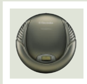
More than 200 improvements