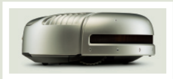
Superior cleaning thanks to powerful brush-roll and suction system